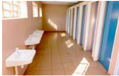
Ablution facilities built at schools around South Africa.