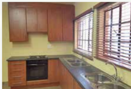
Feeding Scheme Kitchen at Motshegafadiwa Primary School.

Schools that benefitted: Lower Ndakana Primary School in the Eastern Cape and Mbokota Primary School in Limpopo.