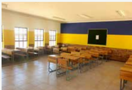
Classroom at Ditsepu Secondary School.